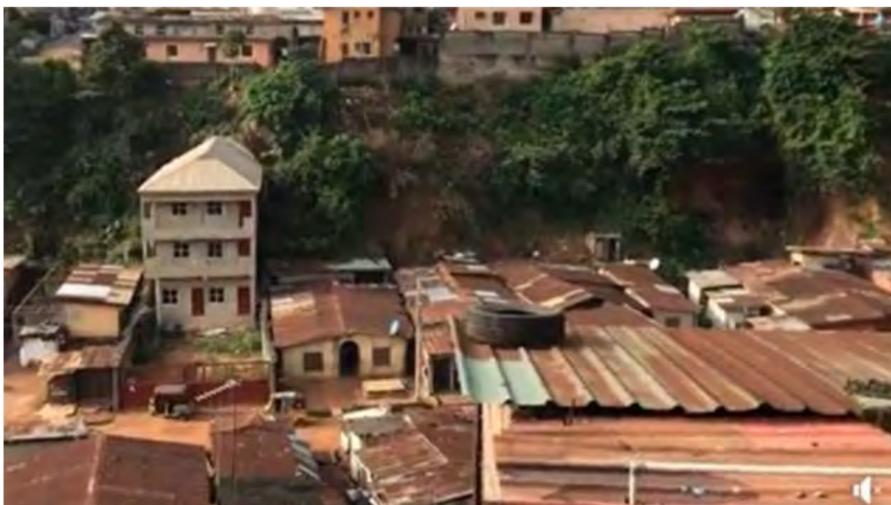
Effects of erosion on some houses

He urged residents to eschew all activities that could lead to soil degradation and encouraged society to conduct activities that improve soil health.