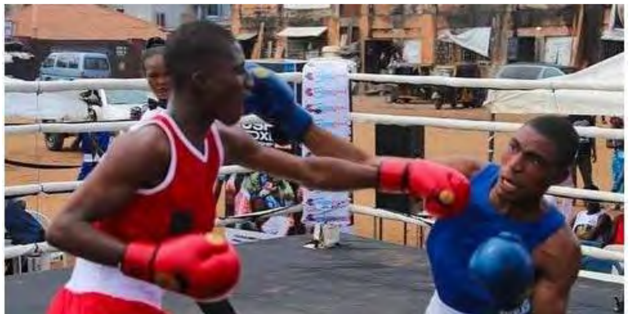
(Two young boxers exchanging punches at a grassroots boxing championship)

entry. 12 Legacy Hotel and Suites is located at 10-12 Koya Akinwale Street, off Aina Obembe Road, Ipaja, Lagos.