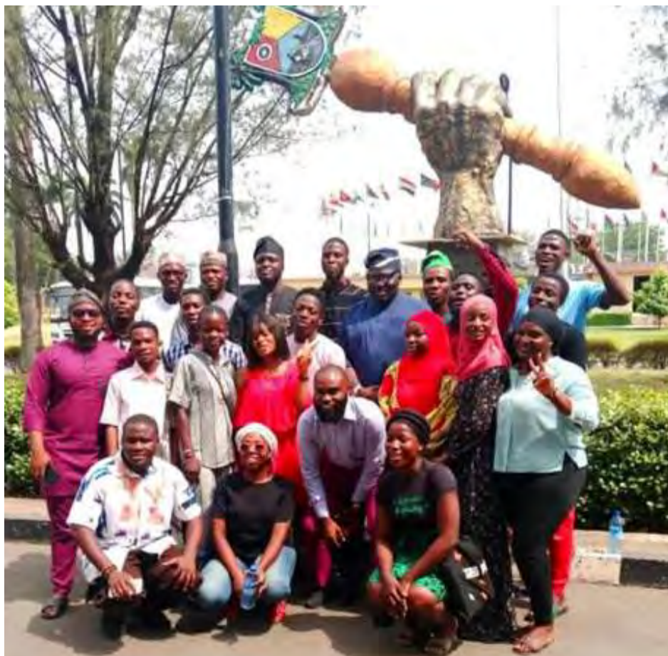
(Hon. Prince Ayinde Akinsanya (OSMAK), representing Mushin constituency 1 in the Lagos State House of Assembly (LAHA) with members of the National Association of Odi-Olowo Tertiary Students)

(Akinsanya emphasized the importance of education as a catalyst for personal and societal development.)