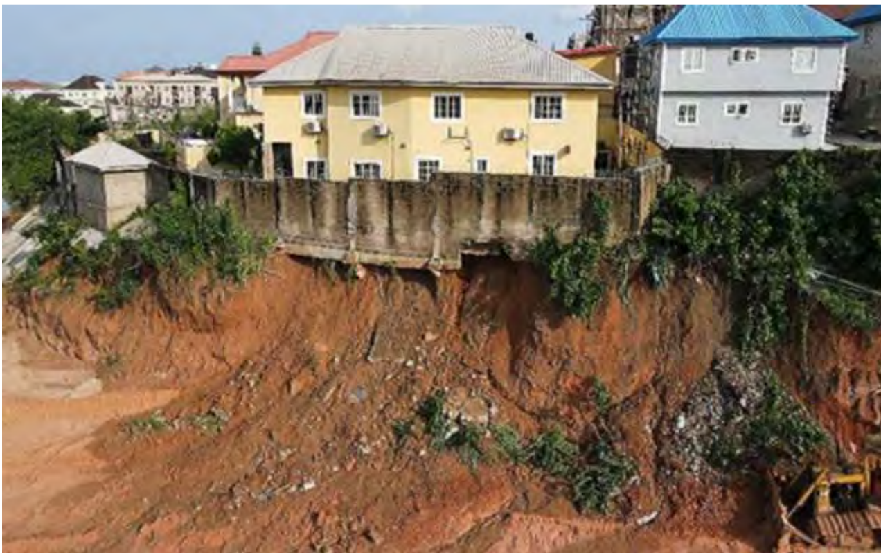
Effects of erosion on some houses