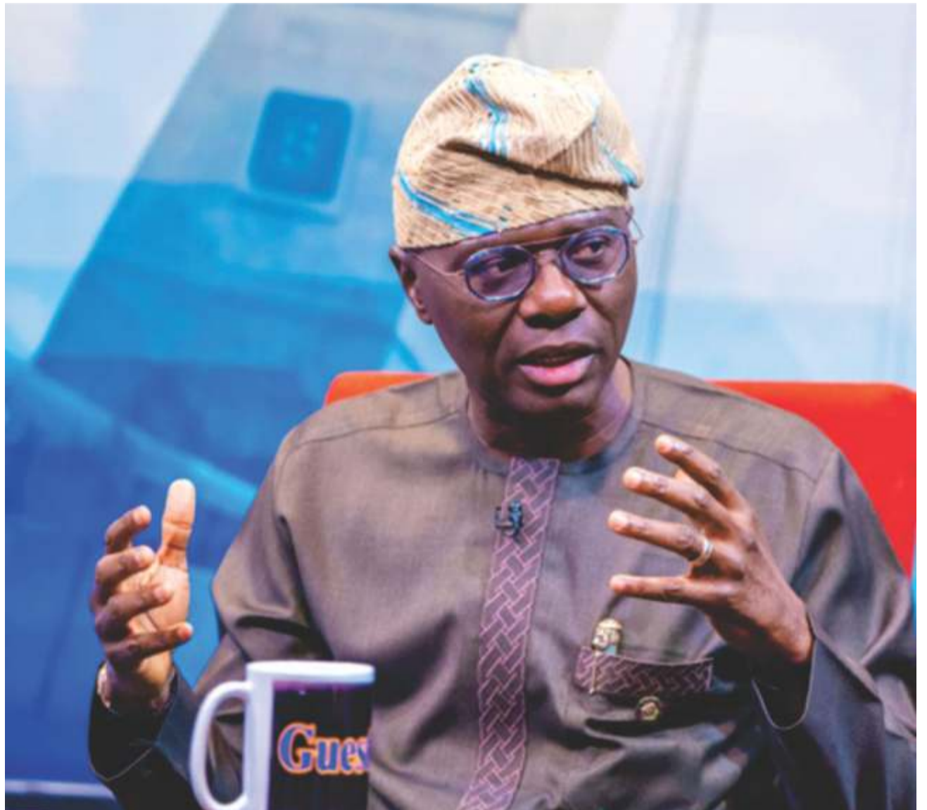
Goernor Babajide Sanwo-Olu

Many residents live in the gully at Oke-Ira, the Ogba area of Lagos, which our correspondent visited. The community is not structured and widely open to gully erosion. It was observed that the residents hardly sleep in the community during the rainy season, and those on