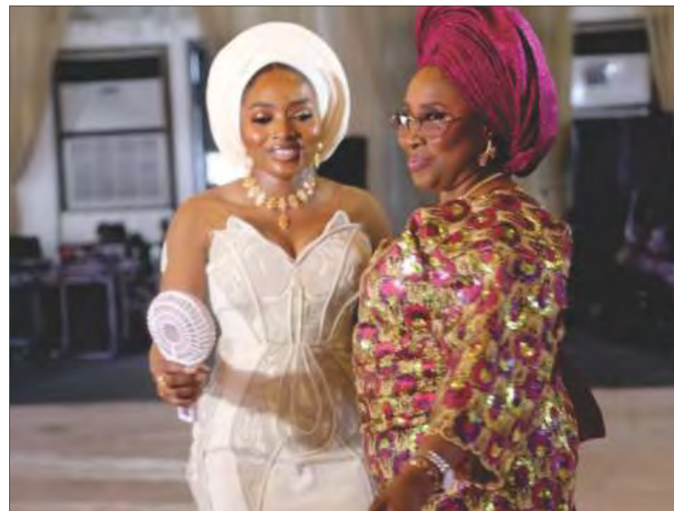
Mother and daughter