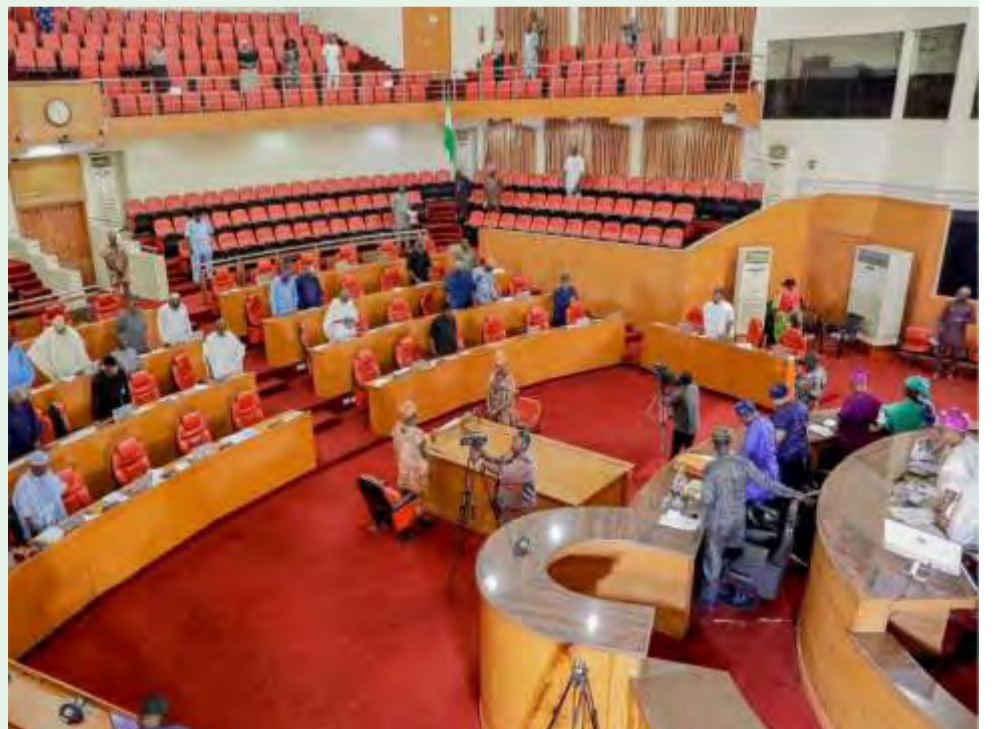
Lagos House of Assembly

While expressing that the regulations surrounding the bill will be strictly enforced, they disclosed that a fine of N10 million fine will be imposed on violators.