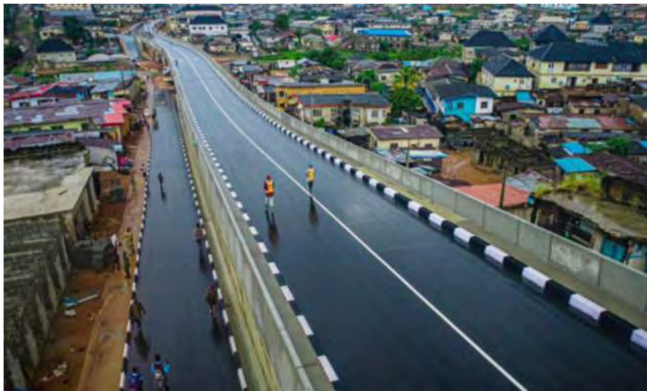
Abiola-Onijemo Link Road

Says administration is committed to addressing long-standing challenges faced by Lagos residents